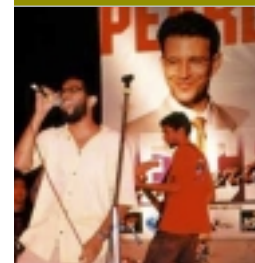
Panjim, Goa, India