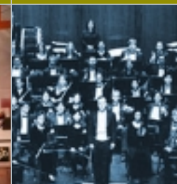
Los Angeles, CA